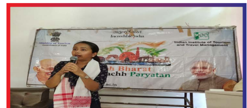
Ministry of Tourism, GOI sponsored Program on Swachh Bharat Swachh Paryatan